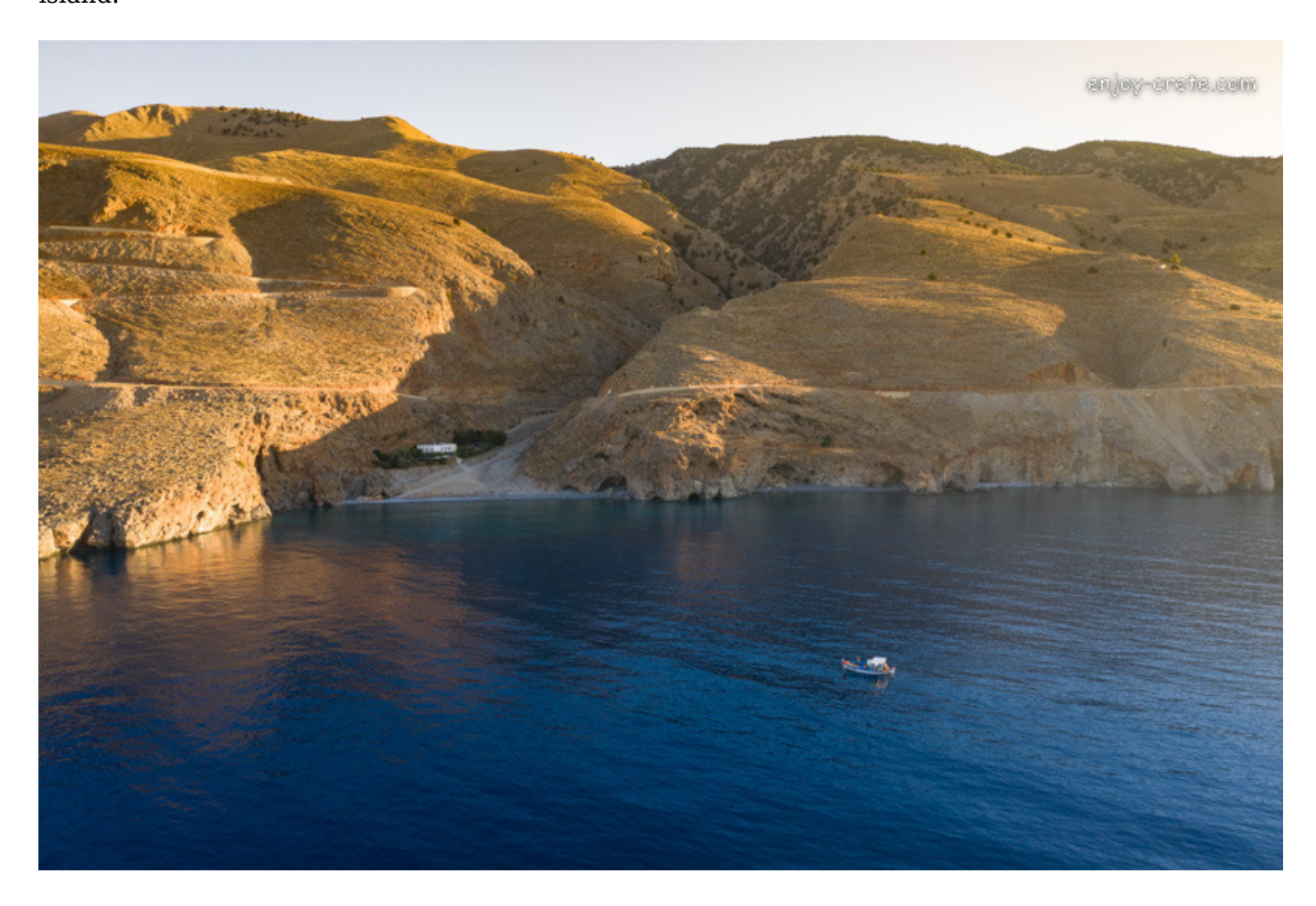
Ilingas beach, south Chania

Apart from the old <u>Venetian port</u> is not something interesting to discover with sea kayaks. On the other hand the south coast or the far north west part (near to Gramvousa island) is a lovely paddle. Having said that is quiet often to have big swell & waves along with strong winds especially during the summer months thus making a safer choice to paddle anywhere in the south part of the island.